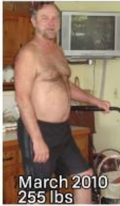
March 2010 255 lbs "Vanity Lost" Age 60

"If God intended for us to be vegetarian, we would still be climbing trees for a living... We'd be competing for the sweetest piece of fruit at the top of the tree..."