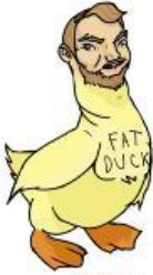
From: "Loser" Fat waddling duck

Called crazy & outrageous because: Mike's "top 10 Favorites" include Burgers, Beer, & Bread