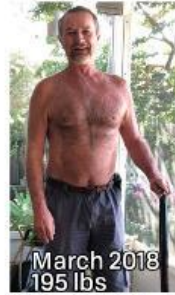
March 2018 195 lbs "Vanity Found" Age 68

Defending vanity see page 1 Apology to vegans page 3